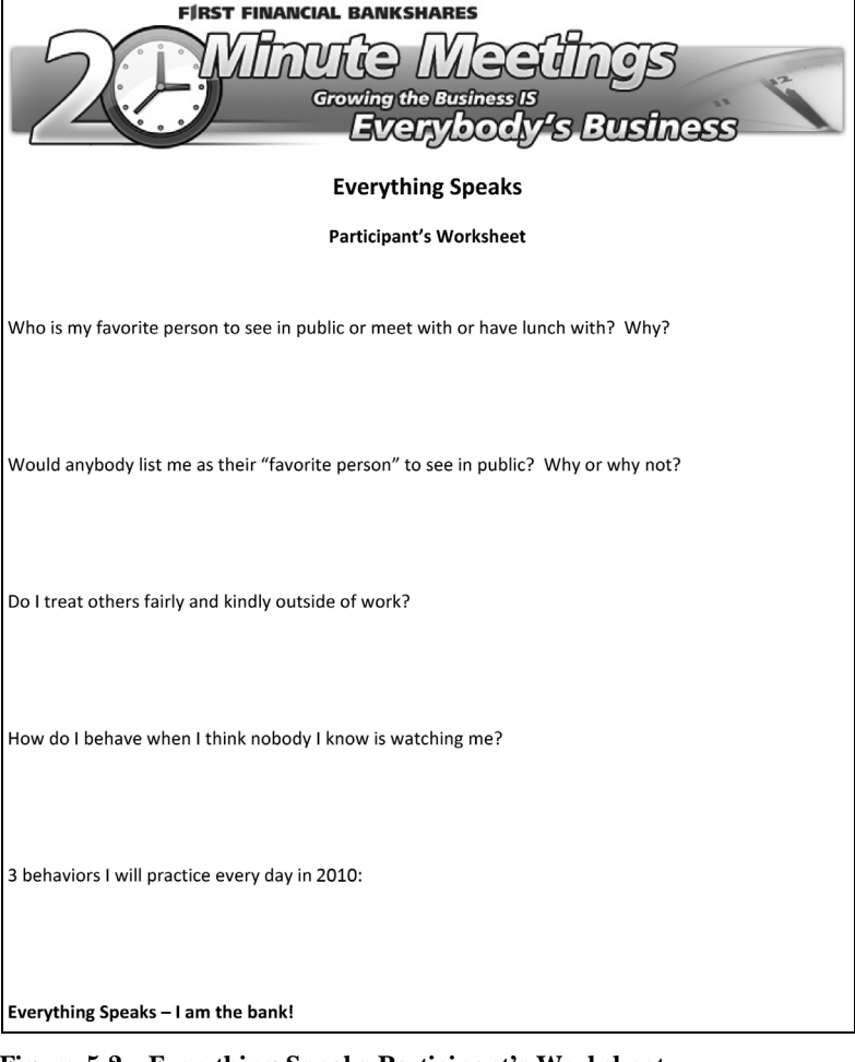
Figure 5.2 Everything Speaks Participant's Worksheet

The point is to be creative in using every means available to communicate the Service Philosophy and Service Standards. As you go through the information in this chapter, consider all of the media available in your organization for communicating the message of service excellence.